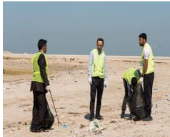
THE BEACH CLEAN-UP EVENT ORGANIZED BY STUDENT COUNCIL RELATED TO SUSTAINABILITY MAPPED WITH SDG 15: LIFE ON LAND