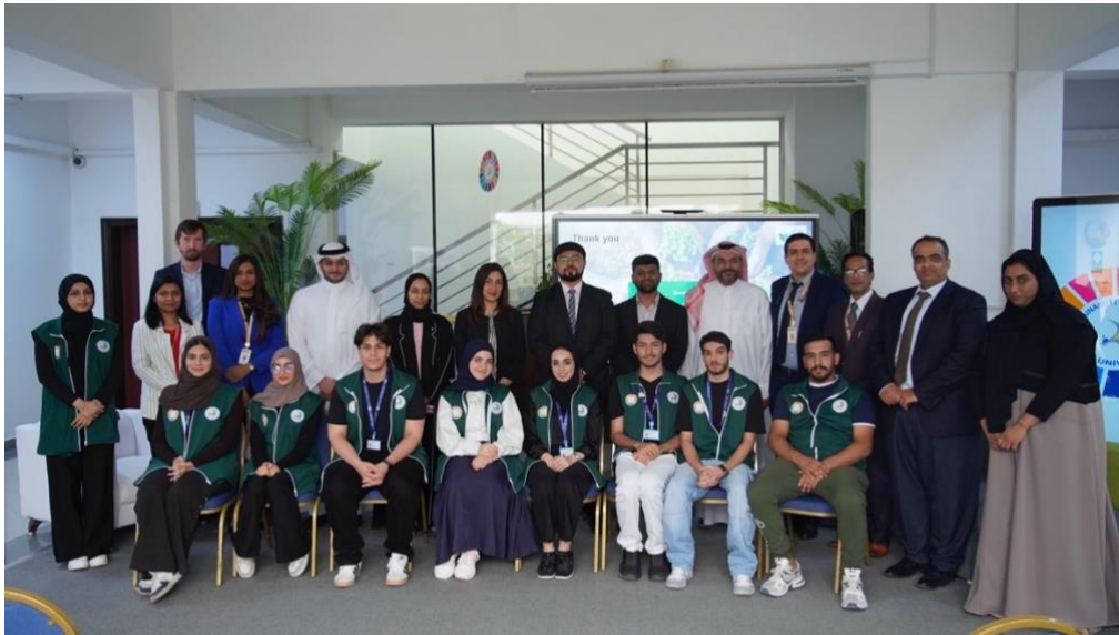
STUDENT SUSTAINABILITY CLUB MEMBERS