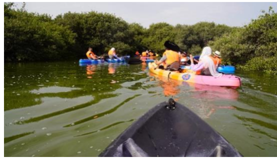
LIFE UNDER WATER EVENT BY SUSTAINABILITY CLUB MEMBERS