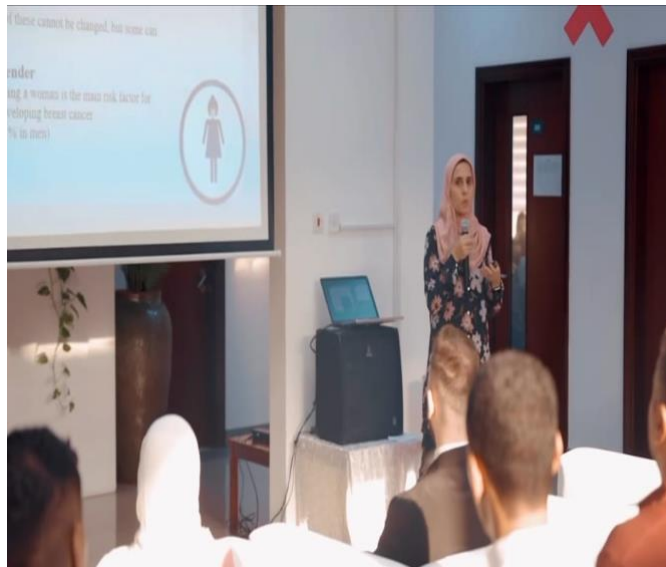
BREAST CANCER AWARENESS EVENT