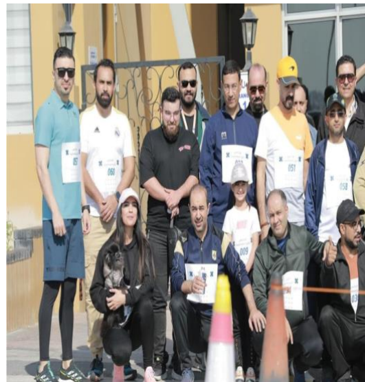
SPORTS DAY FOR STUDENTS & GU STAFF FOR PROMOTING AND THRIVING AND ACTIVE LIFESTYLE