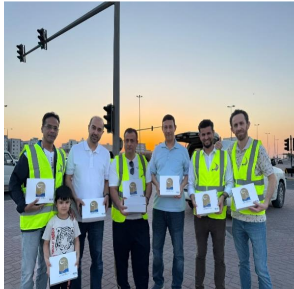
DISTRIBUTION OF FOOD & WATER