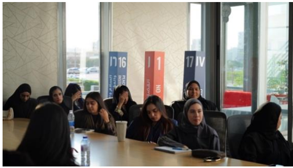
STUDENT CLUB MEETING TO ORGANIZE SUSTAINABILITY EVENTS