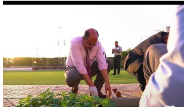
EMBRACING SUSTAINABILITY: TREE DAY PROMOTING ENVIRONMENTAL CONSERVATION AT GULF UNIVERSITY