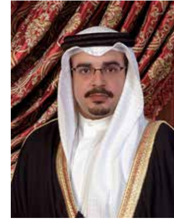
HIS ROYAL HIGHNESS PRINCE SALMAN BIN HAMAD AL KHALIFA