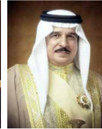
HIS MAJESTY KING HAMAD BIN ISA AL KHALIFA