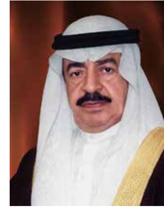
HIS ROYAL HIGHNESS PRINCE KHALIFA BIN SALMAN AL KHALIFA